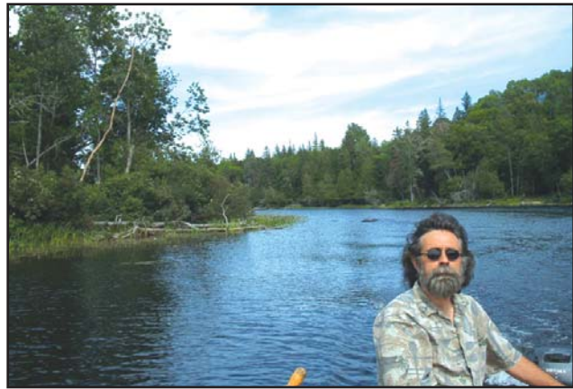
The Picanoc River contributes to the local economy by attracting fishing and boating enthusiasts, with negligible environment impact

The traffic problem could only be improved by relocating the processing of the garbage closer to the source, ie: the city of Gatineau. Lechate, ground water contamination, seagulls and vermin could be completely eliminated by using the most modern and efficient method of garbage disposal available – plasma gasification. This method would immediately dispose of refuse and simultaneously produce electricity. At the same time, the tourist industry and vacation property values on which the local economy and municipalities depend would be protected.