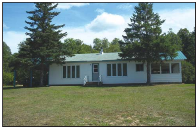
Five Mile Beaver Club

The Club's constitution states in Article 3 that the purpose of the Club is to provide for individual members and their guests a place for recreational activities. Its twenty-five members, and their families and friends, fish during the season on the Picanoc River, primarily in the stretch of river from the clubhouse up to Pine Point, which is located immediately across from the proposed landfill area. In order to survive financially, the Club hosts an annual fishing derby at which the public participants access the river through the Club's property to harvest pike, pickeral and bass. This popular event is well attended and many fish are caught and consumed by fishermen of all ages and their families, including small children.