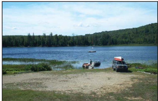
Picanoc River, as seen from Five Mile Beaver Club

Located immediately downstream is the Bear's Den, a club consisting of thirty members engaging in similar activities. Lot 14, Range 6 is home to the Pourvoirie Wayne Tanner, a public fish and game club which offers its facilities to both Canadian and American sportsmen. In the short distance between lots 14 and 24 there are three fish and game clubs and a private lodge (Appendix 2).