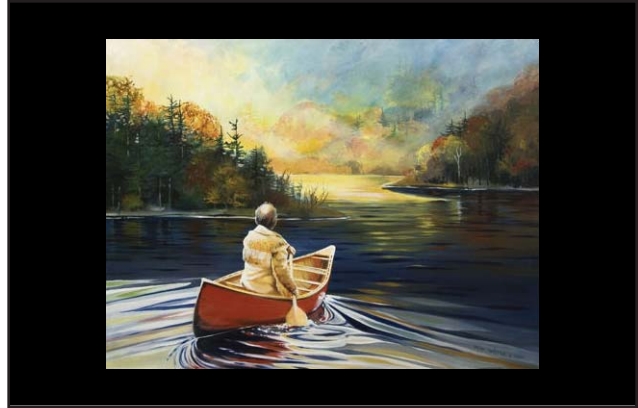
"Esprit" Former Prime Minister Pierre Trudeau exploring the Picanoc River

A landfill containing millions of tons of garbage cannot help but attract seagulls, rats, mice, crows, ravens, bears and other scavengers in vast numbers, which will pollute the river and lakes of the entire area and cause permanent environmental damage. This will have a huge negative impact on the value of vacation property like the Five Mile Beaver Club. Area real estate agents claim that vacation property values have already dropped by 30% in the region in anticipation of the landfill project.